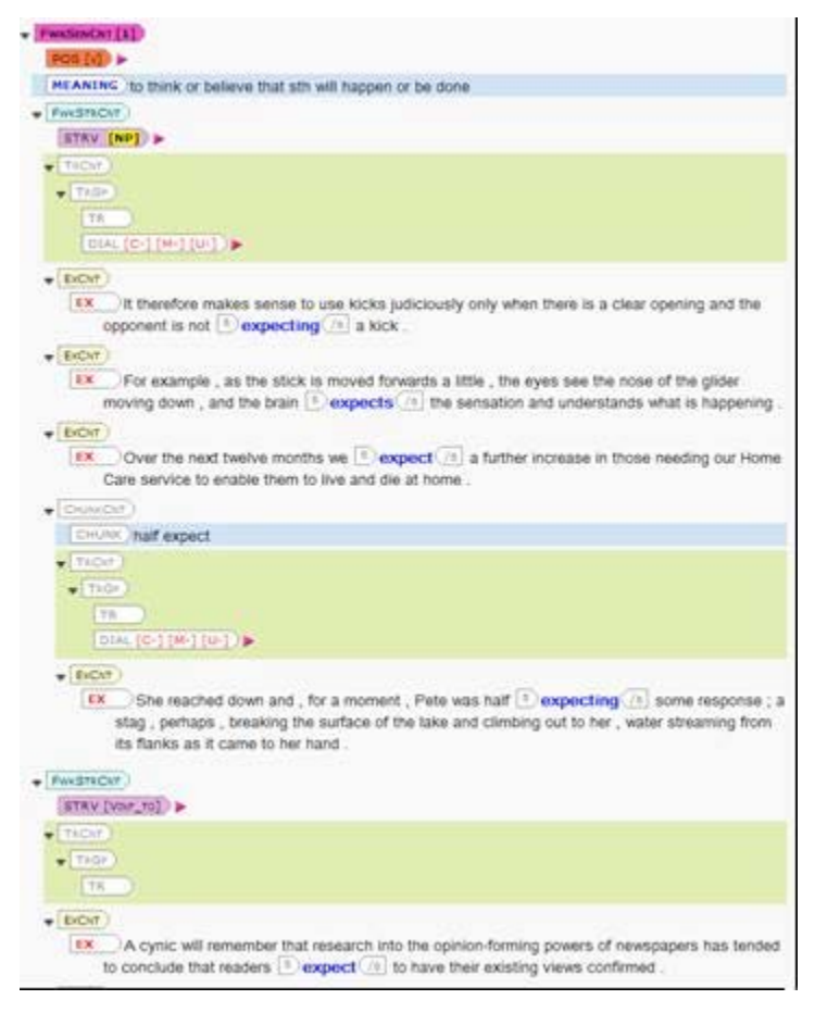
Figure 2: An example of how translation fields (highlighted in green) were automatically inserted at specified positions within the DANTE entries for the translation phase: the first sense unit of expect.