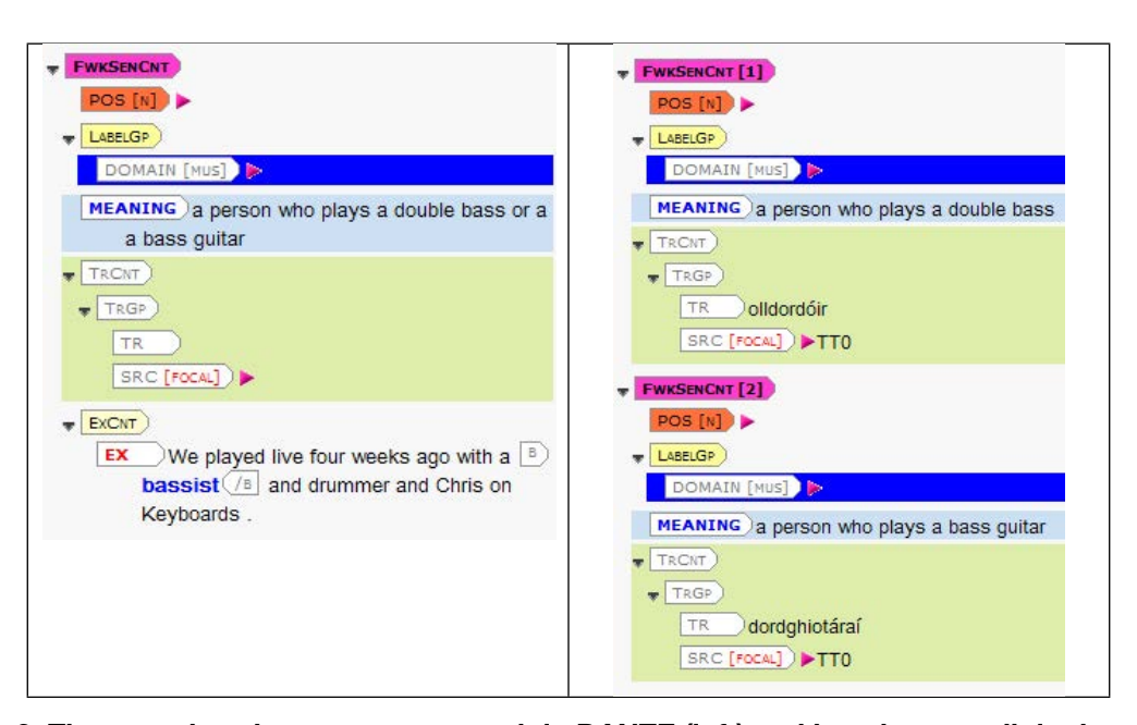
Figure 3: The entry bassist as one sense unit in DANTE (left) and how it was split in the editing database (right).

• if a single sense unit in DANTE requires significantly different translation solutions in Irish (for instance bassist as a single sense in DANTE covers the 'double base' and 'bass guitar' but each instrument requires a different translation in Irish):